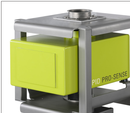
Detection unit with innovative HRF technology

The detection unit with innovative HRF technology (High Resolution Frequency) was developed especially to ensure an optimal scanning sensitivity for all metals. The detection signal is transmitted with a special frequency and evaluated. In addition to ferrous and non-ferrous metals, even smallest particles of non-magnetic stainless steel can now be detected and separated even more efficiently.