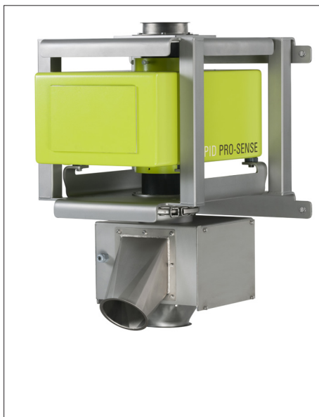
Standard reject unit "Quick-Flap"