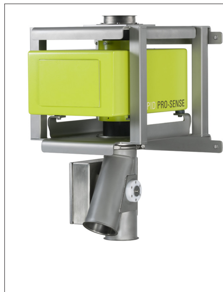
Round reject unit for powder