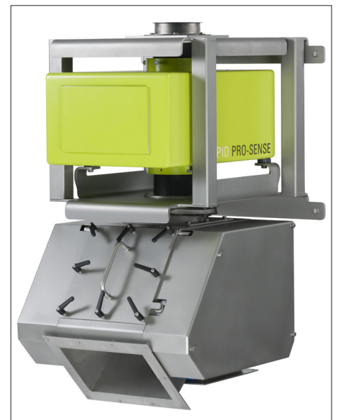
Reject unit with swivel hopper for special materials (Image contains options)