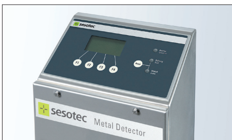
Electronic Control Unit GENIUS+