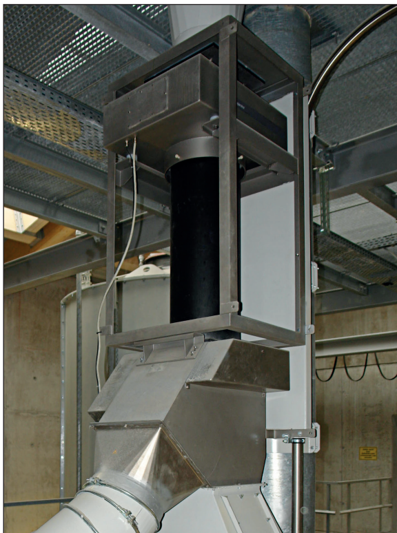
Metal separator RAPID DUAL used for machinery protection during wood pellet production